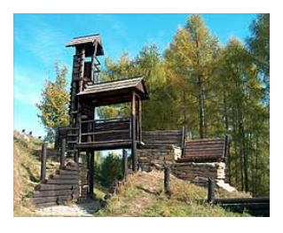
<u>Archeological locality Liptovská Mara - Havránok</u> www.liptovskemuzeum.sk